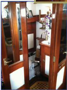
HEAD W/ SHOWER